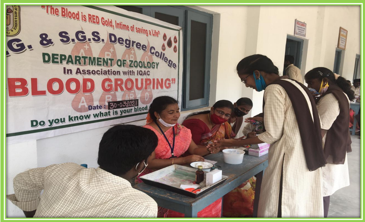
Zoology Faculty conducting Blood group test for first year Degree students