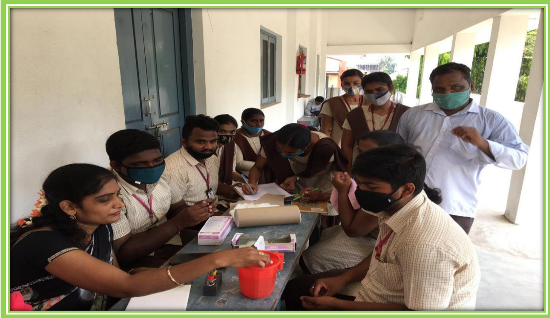
Zoology Faculty conducting Blood group test for first year Degree students