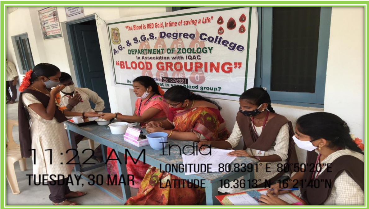
Zoology Faculty conducting Blood group test for first year Degree students