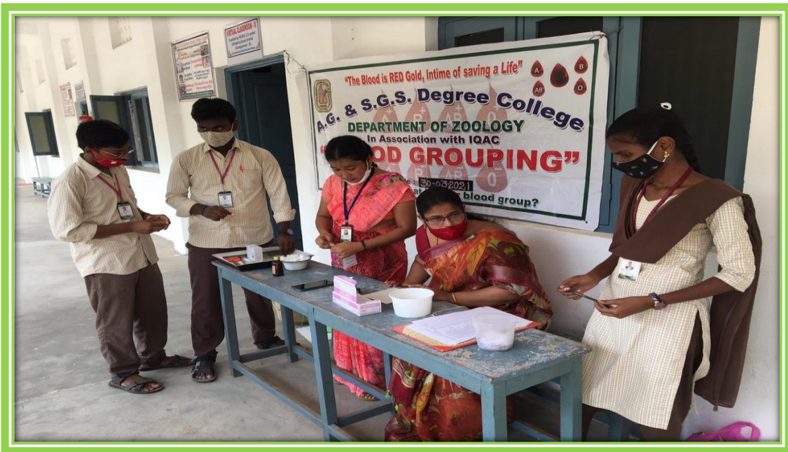
Zoology Faculty conducting Blood group test for first year Degree students